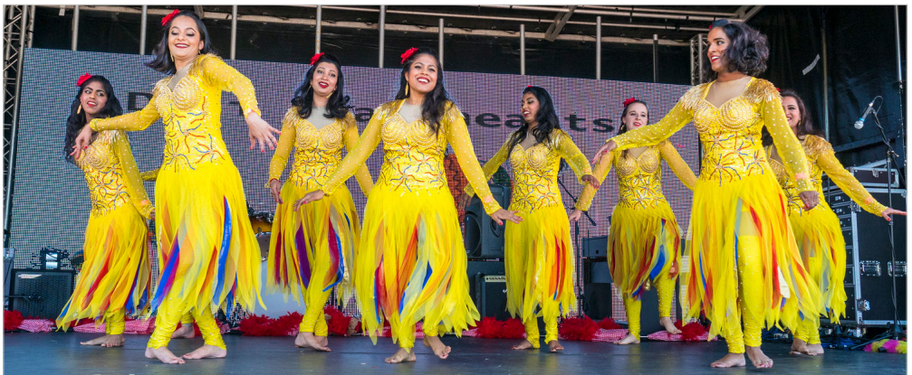
Aberdeen Mela One World Day

Join us on a coach trip round the North-East to explore the song, stories, and locations behind some of the area's most celebrated ballads.