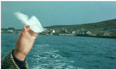
Still from Dùthchas

For many of us there are two places we can call home – where we were born and where we now live. This film is about the yearning for their birth home felt by those who have left the Isle of Berneray in the Outer Hebrides, and the remembrance of the ever-living past for those who have stayed or returned, when the home in their heart is also where they live.