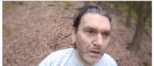
Still from BREATHE

Time: 6.30 to 8pm | Location: MacRobert Building MR051