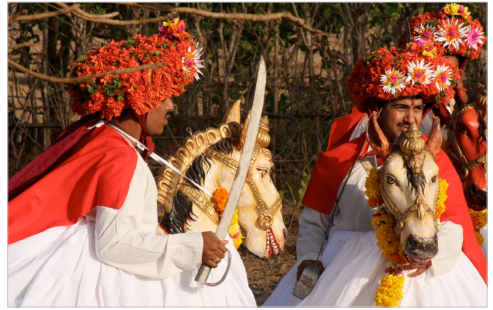
Still from Dances of Goa

Time: 6.30 to 8pm | Location: MacRobert Building MR051