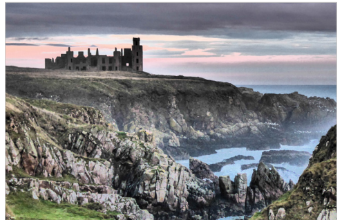
Slains Castle