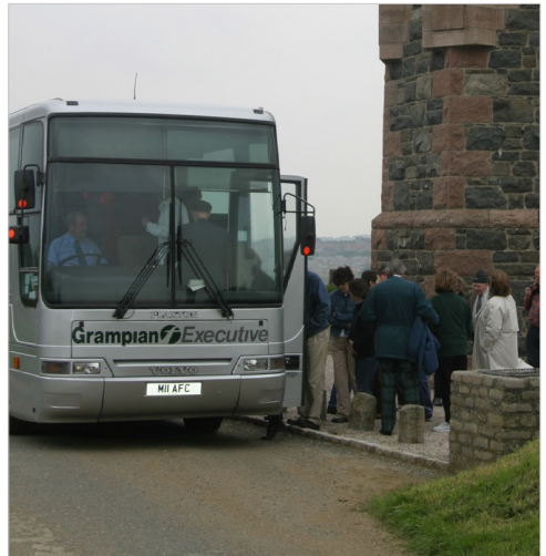
The Ballad Bus, Harlaw Monument

Time: 9 to 5pm | Location: Meet at MacRobert Car Park | £15/£13 for Friends of Elphinstone Inst.