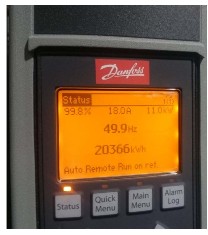
Pump Speed and Consumption before VSD Installation