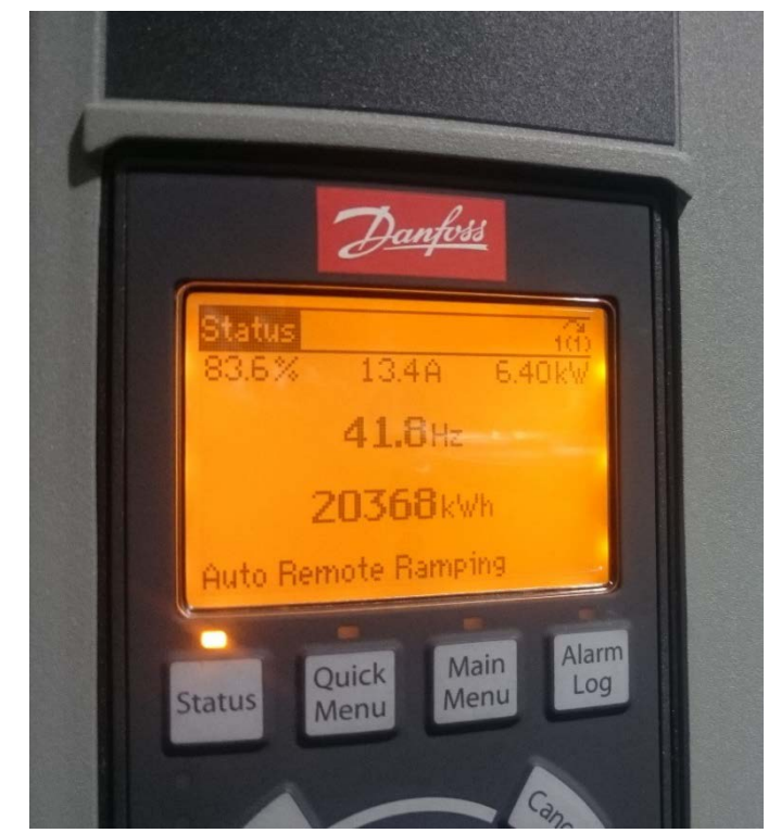
Pump Speed and Consumption after VSD Installation